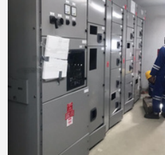
Electrical & Instrumentation Works