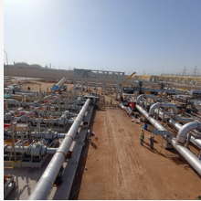
Specialized EPC Projects in Oil, Gas & Petrochemical Plants

As an EPC, PETRO-V delivers specialized and integrated services across energy, water, oil & gas, and construction sectors: