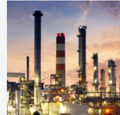
Turnarounds & Shutdowns