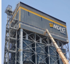
Structural Steel Fabrication & Erection