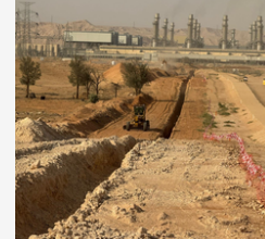
Civil Works (Excavation, Concrete, Earthworks)