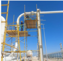
Rehabilitation and Maintenance